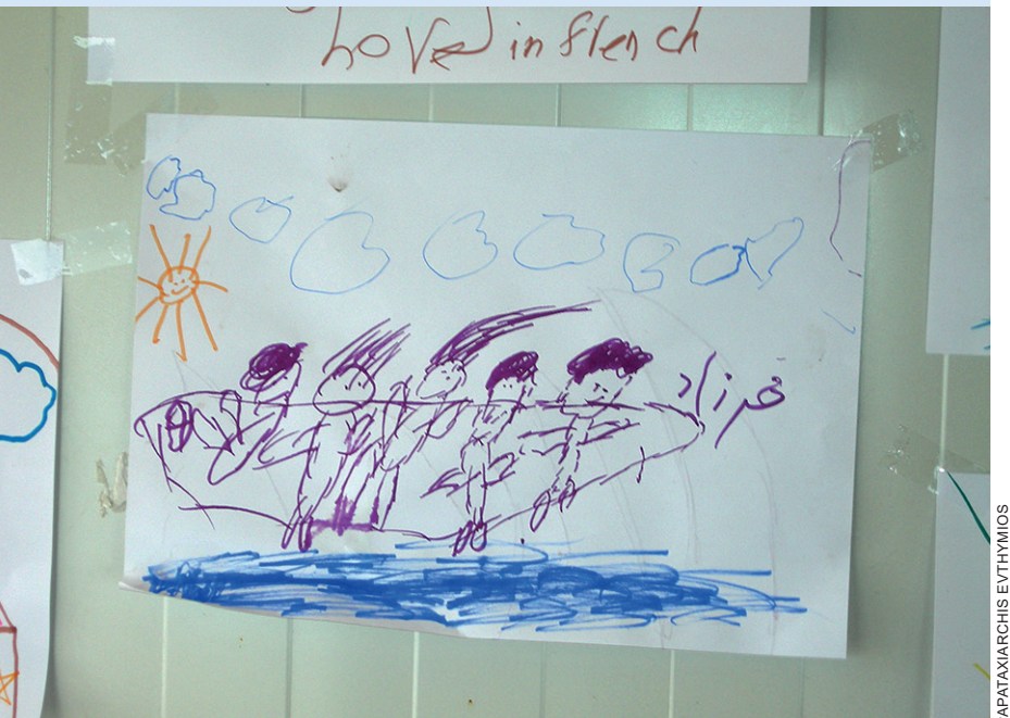
Fig. 5. The rescue: Syrians and Iraqi refugees arrive from Turkey at Skala Sykamias, Lesbos, Greece, 30 October 2015. Spanish volunteers (rescue team-with yellow-red clothes) from 'Proactiva open arms' help the refugees. Fig. 6. After the rescue: A mixed crowd on the beach of Skala Sykamnias. Fig. 7. Fragile lives. Drawings by refugee children in the 'first reception' camp of Platanos (plane tree) in Skala Sykamnias.

this perspective demands that engines are 'destroyed' and turned into junk. Only in this capacity can they be appropriated to be sold as metal – thus ideally covering the cost of cleaning the beaches.