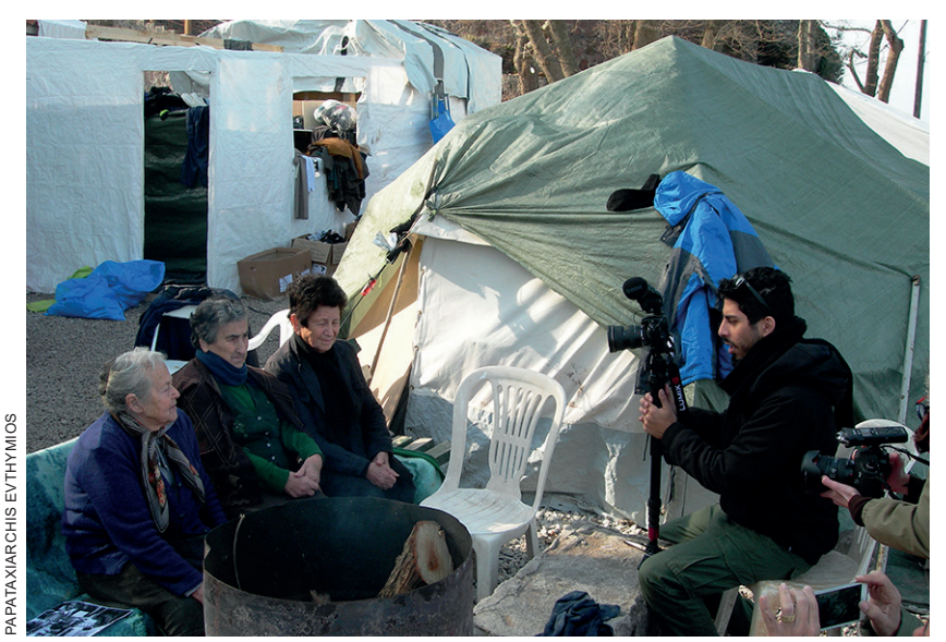
Fig. 11. The actions of the three grannies as the subject for journalistic reporting.