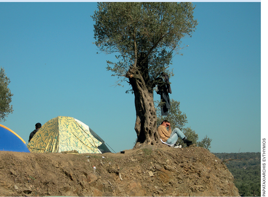
Fig. 8. Watching the Turkish border.

Fig. 9. Some of the material remains of the sea journey in the nearby chomateri (rubbish dump).